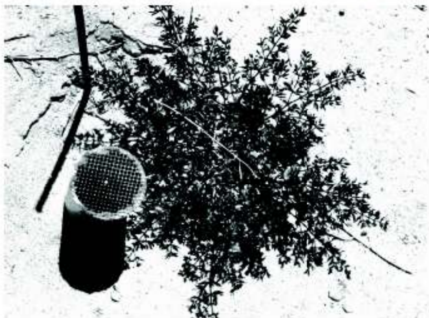
Figure 1. Deep Pipe Installation with tree shelter and mesquite

Deep pipe irrigation is commonly done with 2.5-5 cm diameter plastic pipe placed vertically 30-50 cm deep in the soil near a tree seedling. A screen cover (1 mm mesh) can be added to keep out lizards and animals (Figure 1). Alternatively, bamboo with the node partitions drilled or punched out, rolled veneer, or a slat box can be used. If none of these are available a bundle of tightly tied straight twigs can be used. The seedling should be fairly close to the deep pipe (2.5-7.5 cm inches for a young plant). The deep pipe should be set fairly close to small seedling (2.5-7.5 cm away), while the pipe can be set further from larger plants. Several pipes may be used for a larger tree. These can be arranged around the tree to encourage symmetrical root growth to resist windthrow. By delivering irrigation water through deep pipes rather than on the surface, tree roots tend to grow down rather than at the surface where grains or vegetables may be seasonally intercropped.